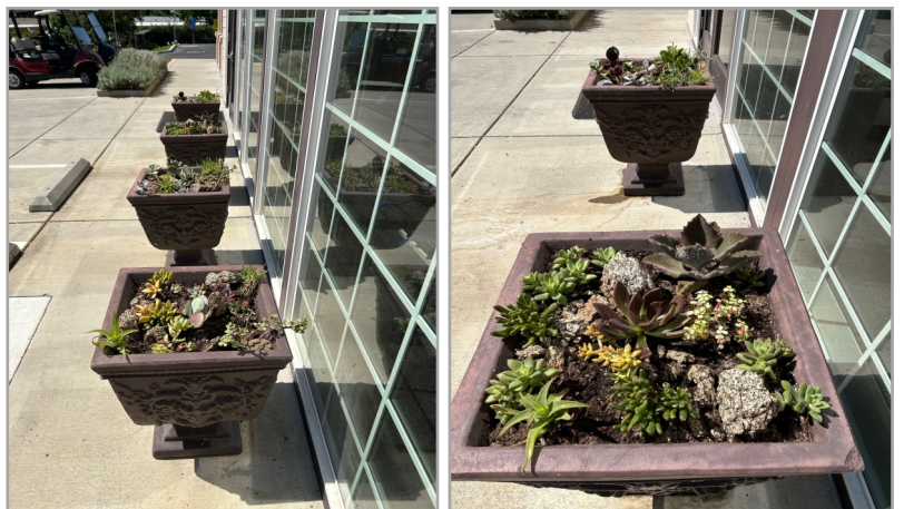
A beautiful assortment of succulent's recently planted by Garden Club

If interested contact Karl Breitenfeld at 760-509-5474